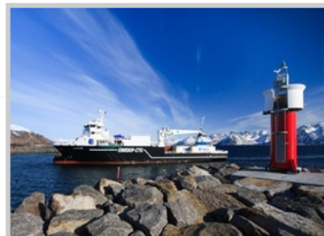
The Norwegian cargo vessel Svartfoss.

This is the third time Eimskip CTG calls up the Pechenga Bay, which is part of the militarized Russian border zone on the Kola Peninsula, some few kilometers from the border to Norway.